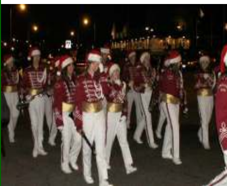
Christmas Parade 2009