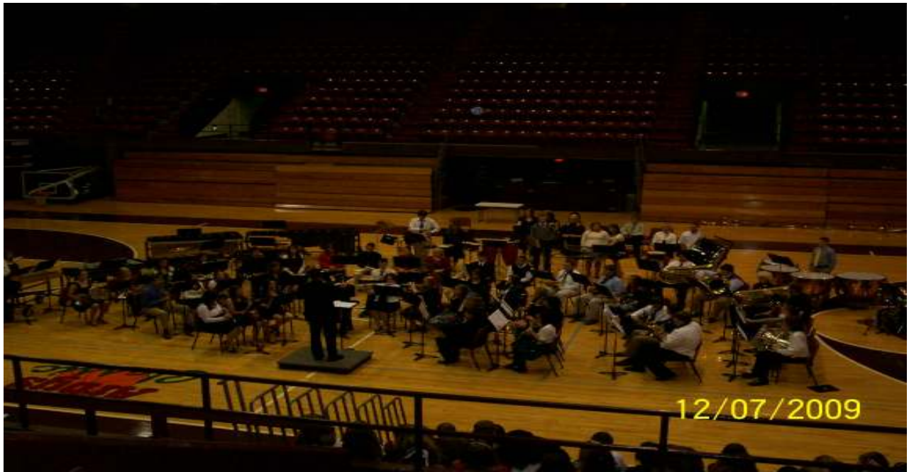
Christmas Concert-Viking Hall 2009